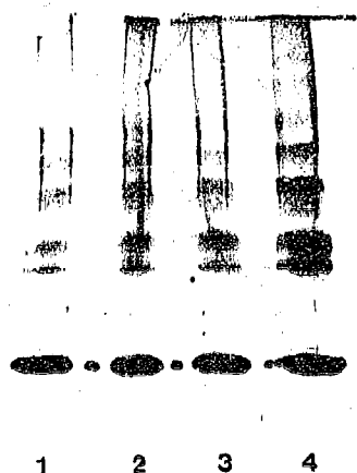
Fig. 2. SDS electrophoresis of cytochrome P-450 cross-linked in solution (4) and in proteoliposomes prepared by the cholate-gel filtration procedure (1-3). Egg phosphatidyl choline was used as the lipid component. (1) and (3), 2 mM DMS; (2), 4 mM DMS, 30 min treatment; (4), 2 mM DMS, 10 min.

Thus, the above results indicate that the hexameric structure of cytochrome P-450 LM2 discovered in experiments on the solubilized protein [5,6] seems to be preserved in proteoliposomes. This fact is consistent with our previous observation that the immobilized cytochrome P-450 hexamers cannot be dissociated by the phospholipid treatment [8,9], as well as with data on rotational diffusion of cytochrome P-450 [3] and with other evidence indicating the existence of cytochrome